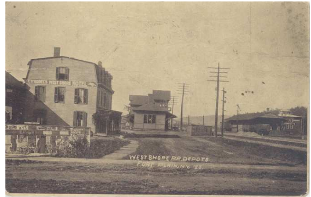
Figure 1 & 2 -- Camp Shirley, St. Johnsville and West Shore Depot, Fort Plain. These postcards were offered for sale on ebay.